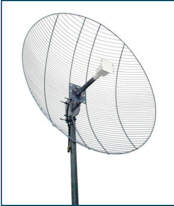
D2423-HP (Shown with DELK)